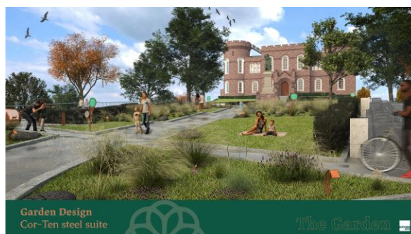
7 - Credit: Mather & Co for the Artist impression of the Inverness Castle Experience and Gardens