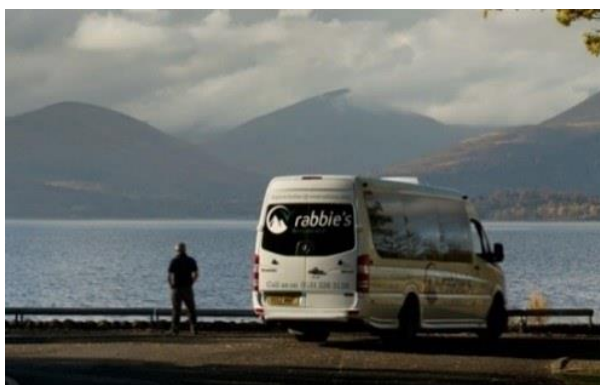
1 - Rabbie's Tours