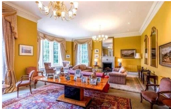
5 - The Sitting Room