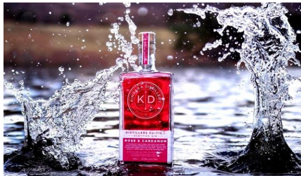
12 - Rose & Cardamon Gin