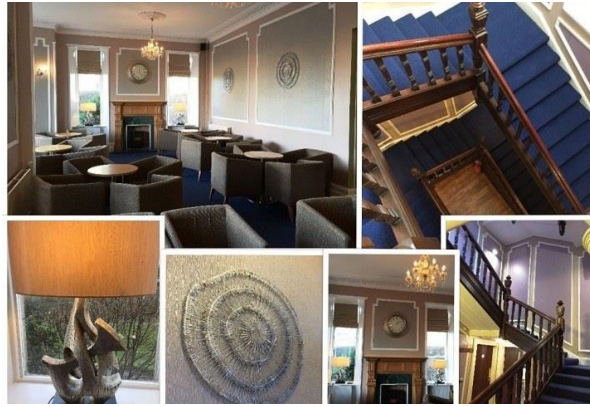
2 - Stotfield Hotel