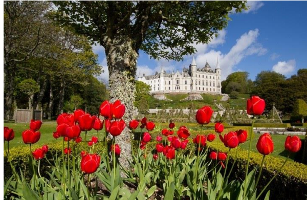
9 - Dunrobin Castle