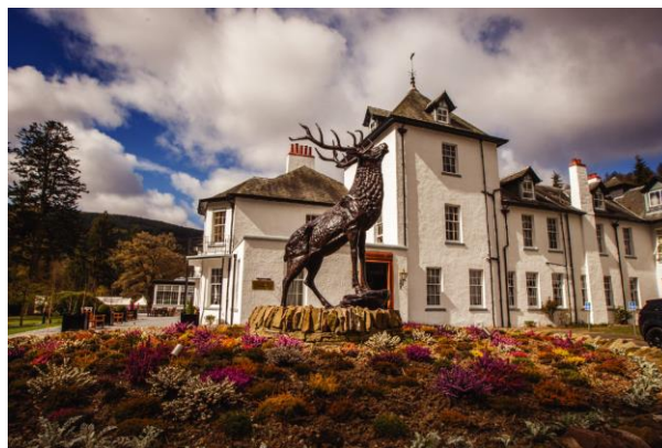
14 - Dunkeld House Hotel - Credit: https://dunkeldhousehotel.co.uk/