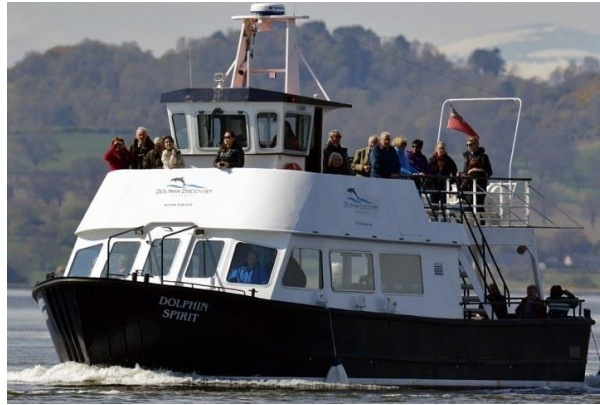
6 - Dolphin Spirit