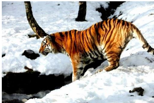
11 - Amur Tiger or Siberian Tiger (Panthera tigris altaica) at the Highland Wildlife Park, Kinraig, by Kingussie