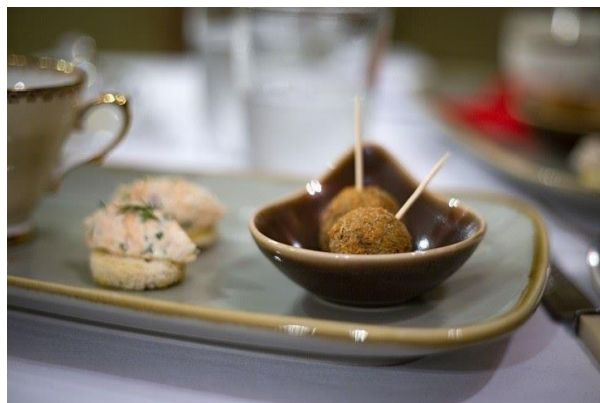
10 - Downright Gabbler