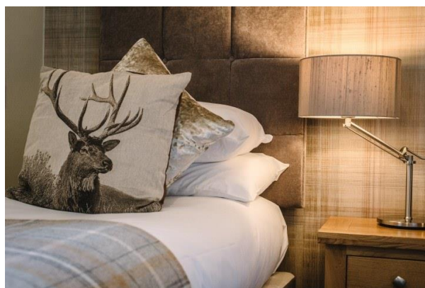
13 - The Boat Country Inn