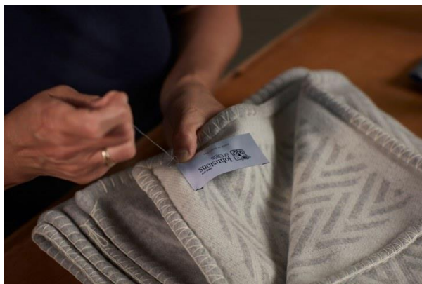
4 - Johnstons of Elgin