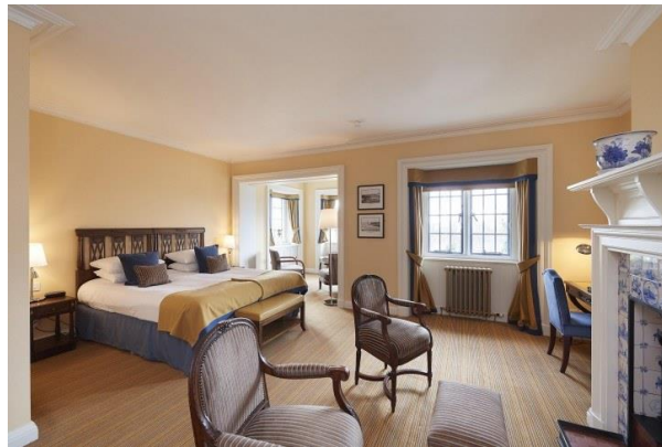
8 - Royal Marine Hotel Brora