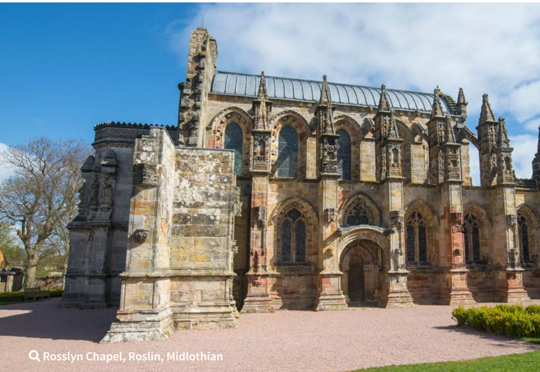
Q Rosslyn Chapel, Roslin, Midlothian