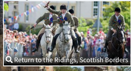
Q Return to the Ridings, Scottish Borders