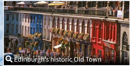
Q Edinburgh's historic Old Town