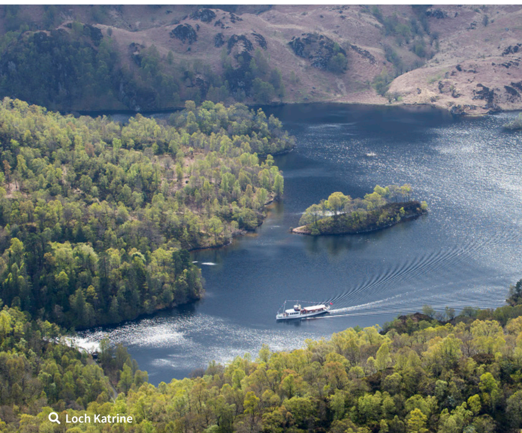
Q Loch Katrine