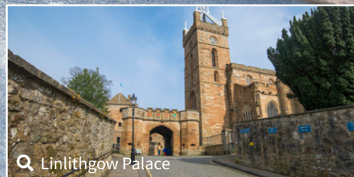
Q Linlithgow Palace