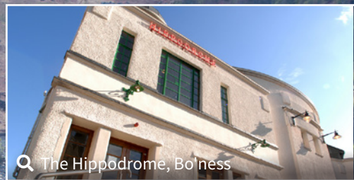
Q The Hippodrome, Bo'ness