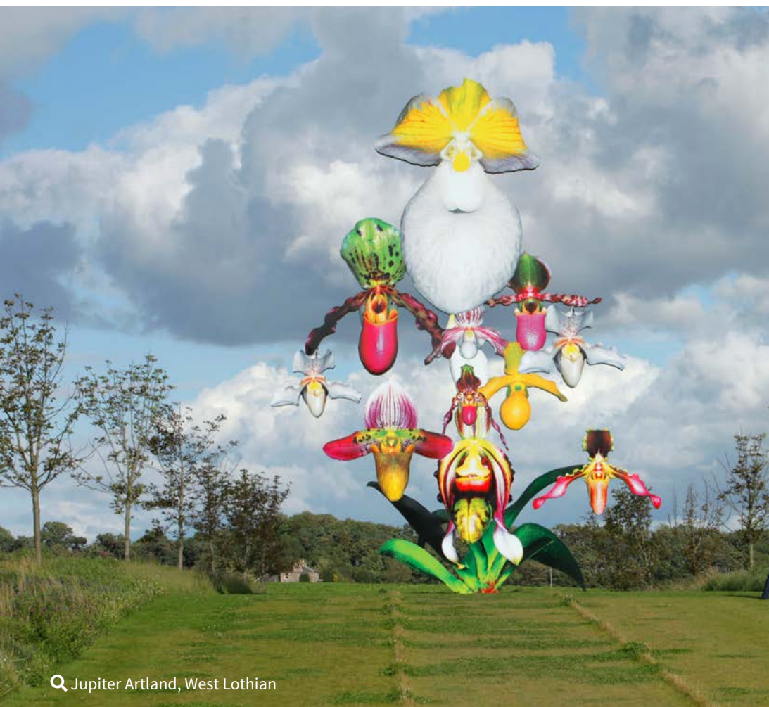
Q Jupiter Artland, West Lothian