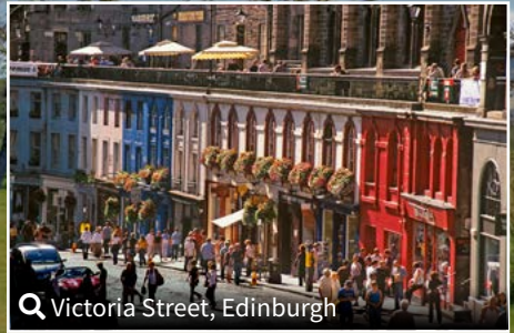
Q Victoria Street, Edinburgh

Delve into Edinburgh and the south of Scotland's rich offering of built heritage, modern landmarks and innovative design. There's an awe-inspiring range of historic and contemporary attractions and sites to discover, as well as opportunities to find out about the people behind some of Scotland's greatest creations.