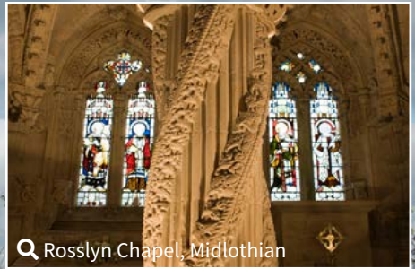
Q Rosslyn Chapel, Midlothian