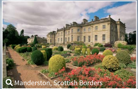
Q Manderston, Scottish Borders