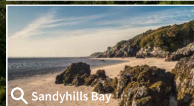
Q Sandyhills Bay