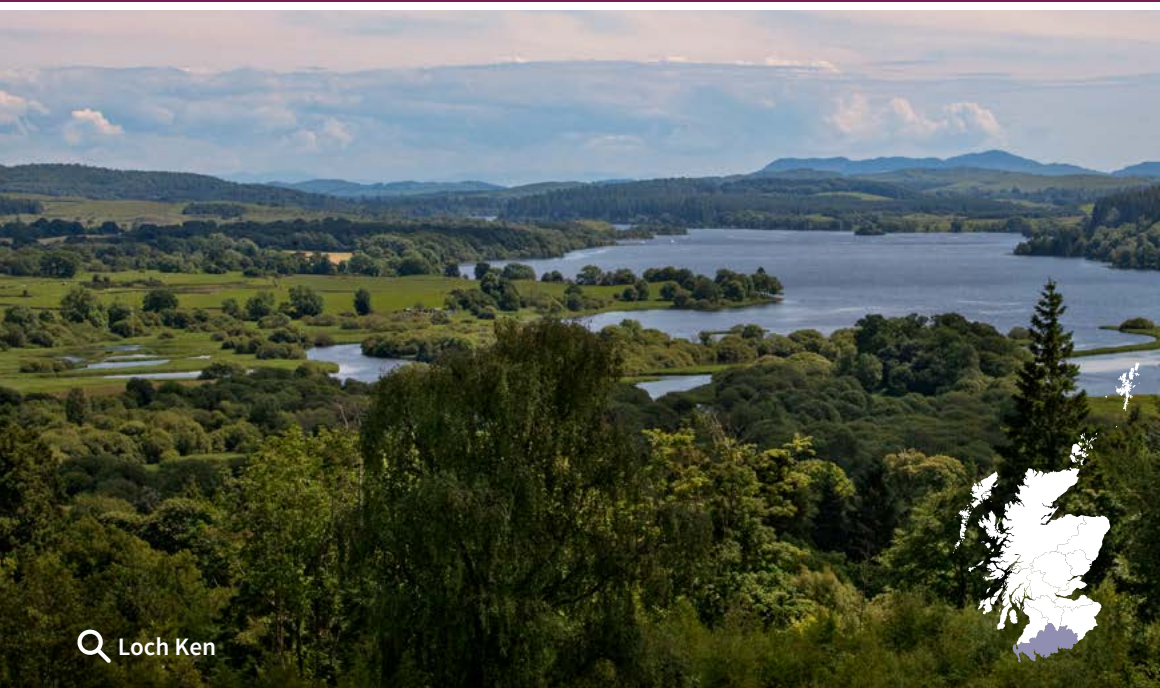
Q Loch Ken