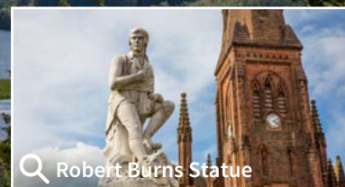
Q Robert Burns Statue