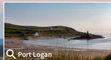
Q Port Logan