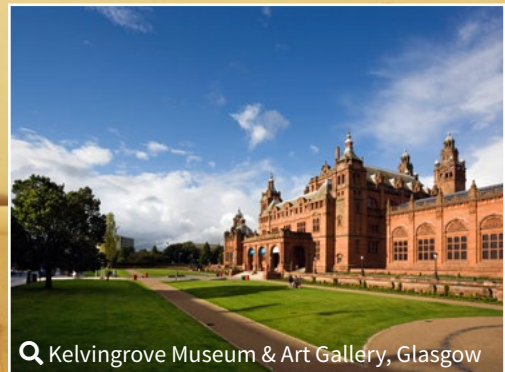
Q Kelvingrove Museum & Art Gallery, Glasgow