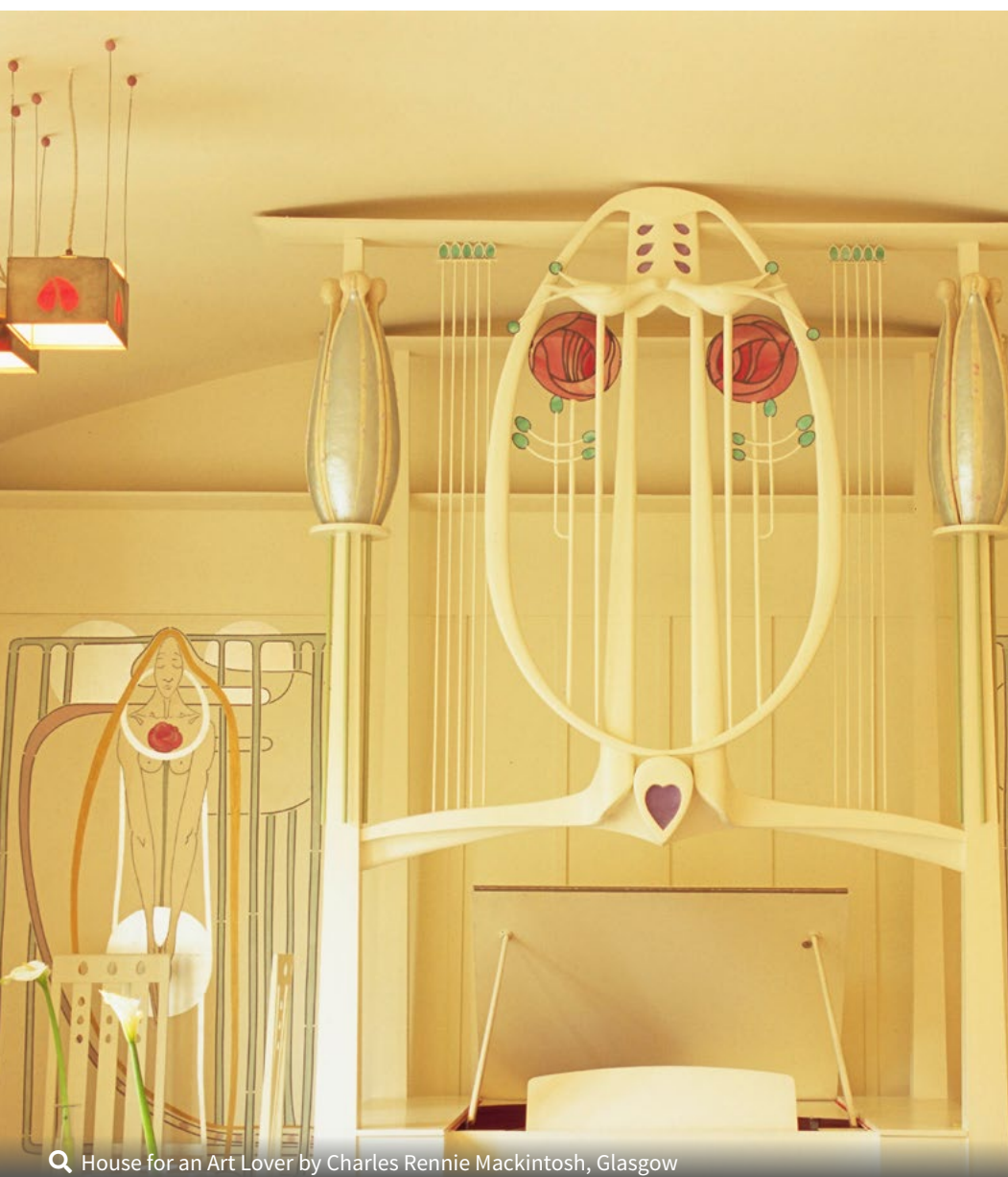
Q House for an Art Lover by Charles Rennie Mackintosh, Glasgow

Glasgow, Ayrshire & Arran, Dumfries & Galloway, and Argyll & The Isles