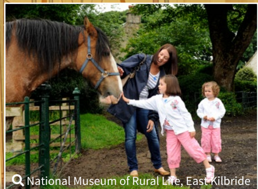
Q National Museum of Rural Life, East Kilbride

Find historic and contemporary contributions to Innovation, Architecture and Design in Glasgow, Ayrshire & Arran, Dumfries & Galloway and Argyll. Discover the beauty and importance of our built heritage, modern landmarks and innovative design, as well as the people behind some of Scotland's greatest creations.