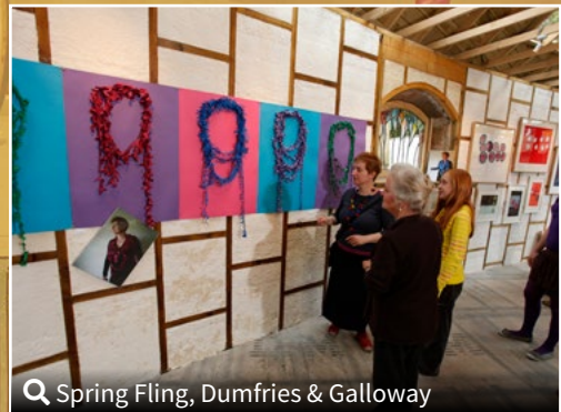
Q Spring Fling, Dumfries & Galloway