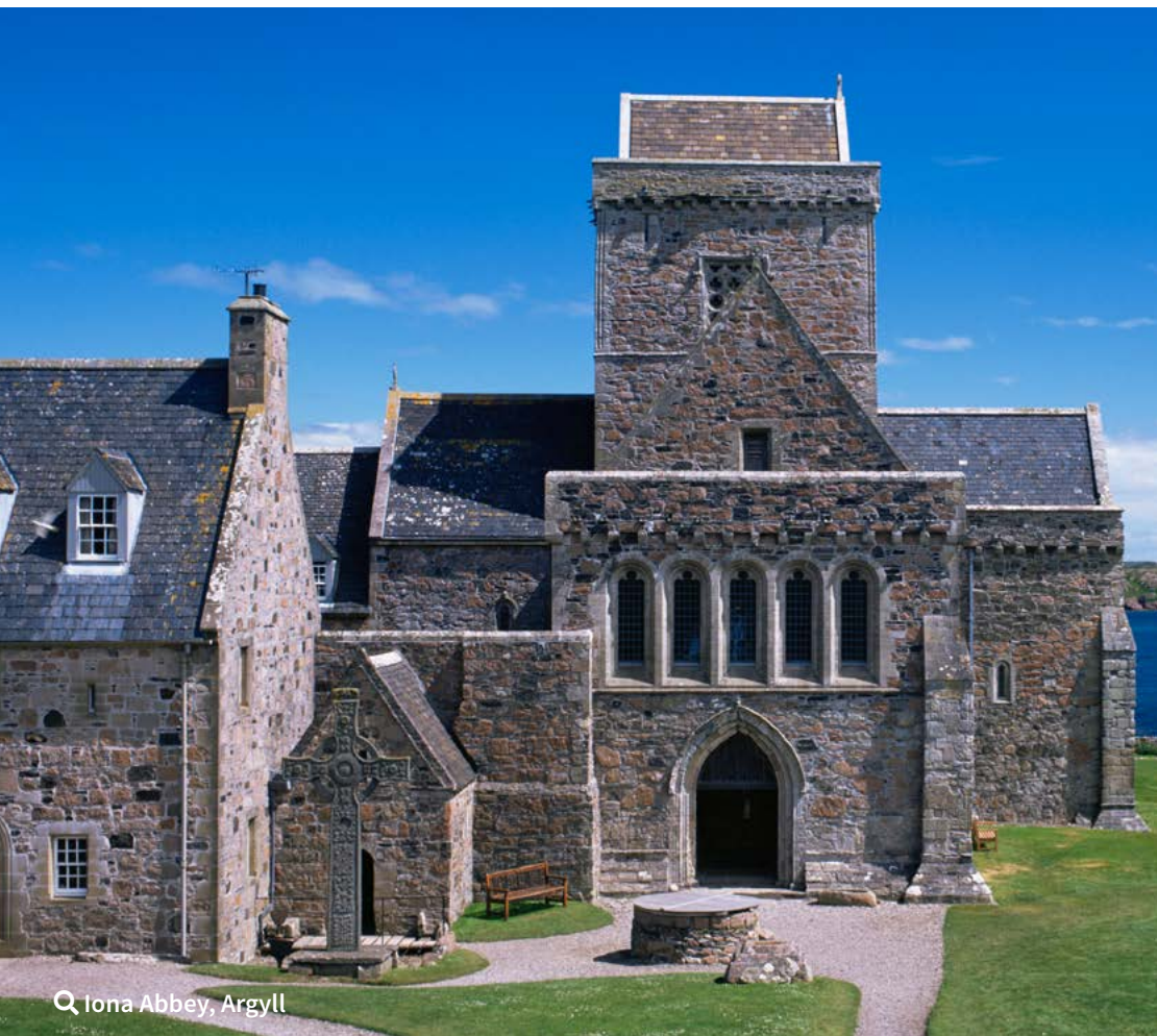
Q Iona Abbey, Argyll

Glasgow, Ayrshire & Arran, Dumfries & Galloway and Argyll & the Isles