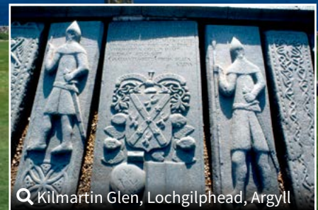
Q Kilmartin Glen, Lochgilphead, Argyll

Discover Scotland's rich history, heritage and archaeology. From the remains of our earliest settlements going back thousands of years, through the turbulent times of the Middle Ages and on to the Scottish Enlightenment and the Industrial Revolution, every area of Scotland has its own tale to share with visitors.