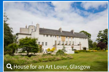
Q House for an Art Lover, Glasgow