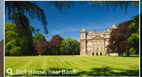
Duff House, near Banff