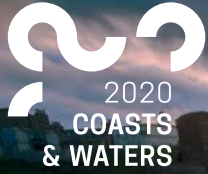
Museum of Scottish Lighthouses, Fraserburgh

Discover one of the world's finest coasts