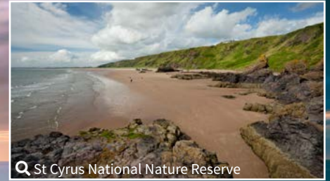
St Cyrus National Nature Reserve