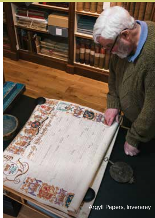
Argyll Papers, Inveraray