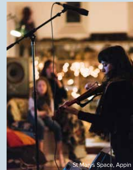
St Marys Space, Appin