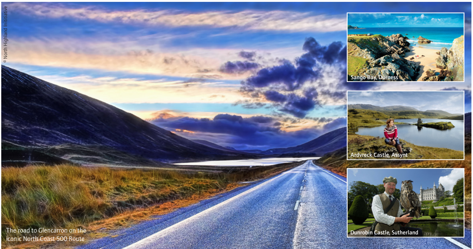
The road to Glencarron on the iconic North Coast 500 Route