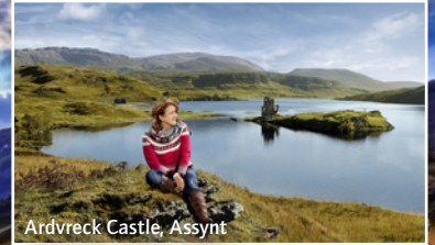
Ardreck Castle, Assynt