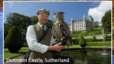
Dunrobin Castle, Sutherland