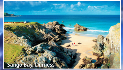
Sango Bay, Durness