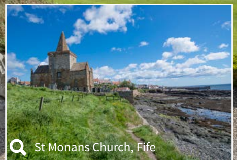
🔍 St Monans Church, Fife