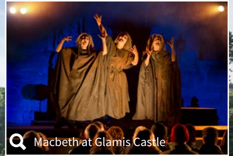
🔍 Macbeth at Glamis Castle