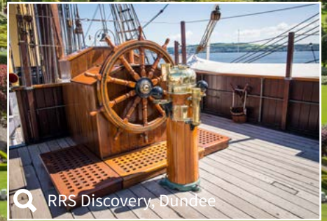
🔍 RRS Discovery, Dundee