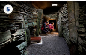
TOMB OF THE EAGLES – Possibly Orkney's most mysterious chambered cairns, acquiring its name after the discovery of sea eagle talons and other remains within the tomb. Circular walk.