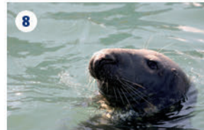
SHETLAND WILDLIFE TOURS – There is an excellent choice of guided tours on Shetland, with otters, seals, whales and spectacular seabird colonies all making the islands a photographer's delight.