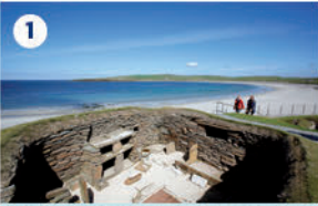
SKARA BRAE – An extraordinary snap-shot of Orkney's far-distant past – a cluster of dwellings complete with Stone Age furniture!

Two separate island groupings, both with a special and distinctive culture - but also one aspect in common: a sense of being very different to mainland Scotland. Explore their Norse heritage; walk out to discover some of the UK's most spectacular wildlife sites and enjoy the local cuisine. This is just the start of a great northern adventure, made easier by good mainland Scotland links, both by air and sea.