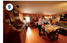
TANGWICK HAA MUSEUM – Restored 17th-century house tells the story of Northmaine (most northerly parish on mainland Shetland). Coastal walking at Eshaness Lighthouse.