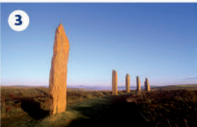
RING OF BRODGAR – One of Orkney's most important Neolithic settings – a circle of stones that have stood here for five millennia.