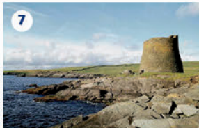
MOUSA BROCH – The UK's best preserved broch – an impressive Iron Age circular tower still standing 12m high on the island of Mousa. Regular boat trips from mainland Shetland.