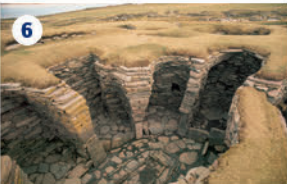
JARLSHOF – Three extensive village settlements, from Bronze Age to Viking times, plus a mediaeval farmstead and 16th-century house, all here on one site at the south end of Shetland.