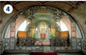
ITALIAN CHAPEL – Italian prisoners of war ingeniously converted a Nissen hut into a beautiful chapel using scrap materials and 'trompe l'oeil' painting effects.