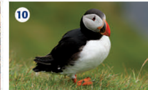
HERMANESS – National Nature Reserve at the top of Shetland with seabird colonies and moor-nesters such as great skuas. Fine walk to hilltop with views to Muckle Flugga, at the very tip of the UK.