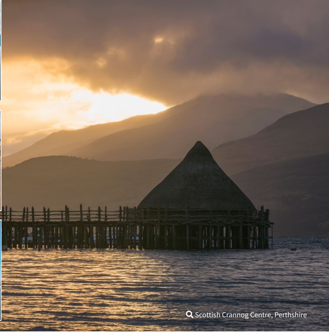
Scottish Crannog Centre, Perthshire

Celebrate the beauty and importance of the variety of modern landscapes, built heritage and innovative designs across Central Scotland, and uncover the fascinating stories behind the people responsible for some of Scotland's greatest creations.