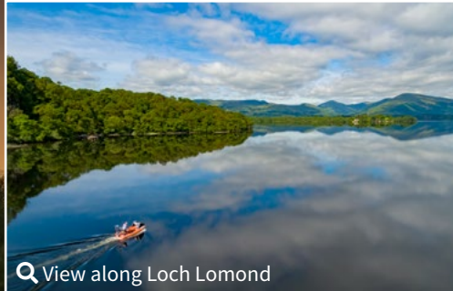
View along Loch Lomond

Central Scotland : Kingdom of Fife, Dundee & Angus, Perthshire and Loch Lomond & The Trossachs