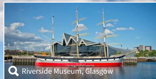
Q Riverside Museum, Glasgow