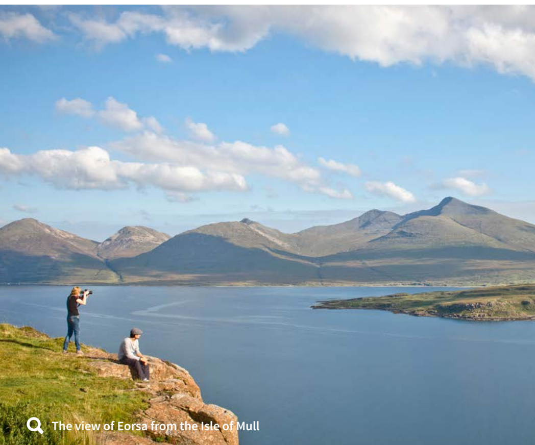
Q The view of Eorsa from the Isle of Mull