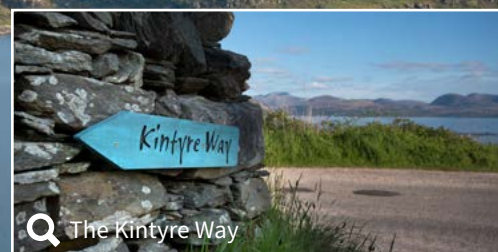
Q The Kintyre Way

Glasgow is the perfect place to find your urban adventure, from keeping active indoors to cycle routes, riverside walkways and even exhilarating water adventures, all alongside a rich cultural offering, renowned shopping and a vibrant nightlife.