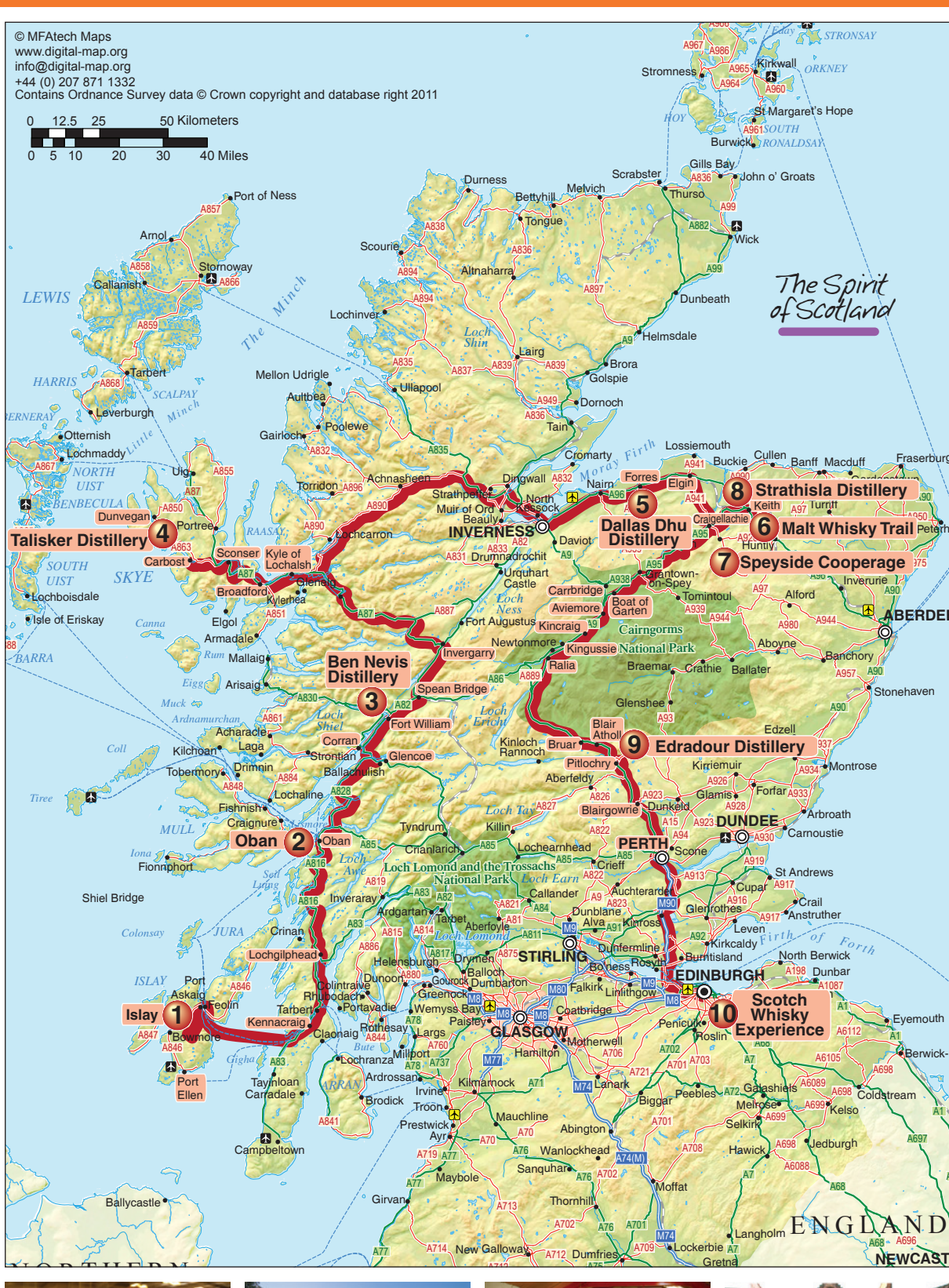
and a cooperage make up the signposted Malt Whisky Trail. It takes the visitor round some of the most picturesque parts of Moray, close to the