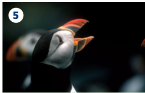
5 WILDLIFE TOURS ON MULL – A choice of operators offer wildlife tours – and all know the very best places to see the island's specialities – including, for example, white-tailed sea eagles and otters.