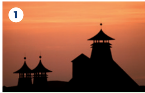
1 WHISKY DISTILLERIES ON ISLAY – Bunnahabhain, Caol Ila, Kilchoman, Bruichladdich, Bowmore, Laphroaig, Lagavulin and Ardbeg are all distilleries on the island. Most offer tours and tastings but check with your VisitScotland Information Centre first.

Good integration of bus, train and ferry means it is quite straightforward to sample many of the Inner Hebridean islands. Even if time is limited, there are plenty of 'there-and-back-again' day cruising options for at least a glimpse of island life – and some great views of seabirds, seals and probably whales as well!