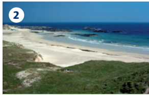
2 COLONSAY – A Hebridean gem and a superb island experience, unspoilt Colonsay offers beaches, wildlife, walks, historic sites, a woodland garden plus golf and fishing – all on an island only 10 miles (16km) long.