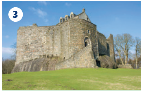
3 DUNSTAFFNAGE CASTLE – A 13th-century castle with impressive curtain-wall and round towers. This former stronghold of the MacDougalls once watched over the 'sea-roads' of Argyll & The Isles.