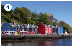
4 TOBERMORY – With its colourful harbour frontages, Tobermory has plenty for visitors; including good shops, a museum, distillery, eateries and An Tobar, the Tobermory Arts Centre.