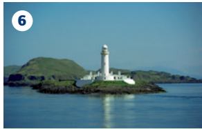
6 ISLE OF LISMORE – Easily accessible island on Loch Linnhe with good path network, wildlife and historic sites, as well as accommodation. Lismore Gaelic Heritage Centre tells the island's story.