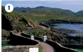
1 ARDNAMURCHAN LIGHTHOUSE VISITOR CENTRE – A lighthouse set among spectacular scenery on mainland Britain's most westerly point, enjoy spectacular views of the Hebrides and small isles or join in the centre's whale watch.

The Highland landscape, wild and unspoilt, provides a range of habitats for wildlife, from the rich seas supporting whales and dolphins, to the high crag and moors, the territory of golden eagles. Though the chance of a casual sighting of seal or otter, red deer or red squirrel, eagle or hen harrier – or any of the other Highland specialities – is quite high anyway, this itinerary takes you to some of the very finest wildlife sites in Scotland, many of them nature reserves.