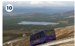
CAIRNGORM MOUNTAIN RAILWAY Year round mountain railway, 150m below the summit of Cairngorm mountain. UK's highest and fastest. Shop, restaurant and mountain exhibits.