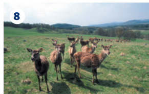
8 ROTHIEMURCHUS ESTATE – Guided walks, safari tours plus many other outdoor activities.