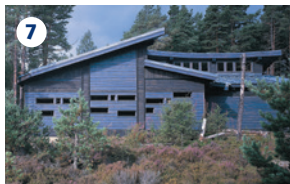
7 LOCH GARTEN OSPREY CENTRE Close-up views in summer of nesting ospreys via tv link. Discover the other birds of the native pinewoods.