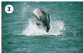
3 GAIRLOCH MARINE LIFE CENTRE & 'SAIL GAIRLOCH' CRUISES – Wildlife cruises where you may see Minke whales, dolphins, porpoise and seals. Wildlife visitor centre.