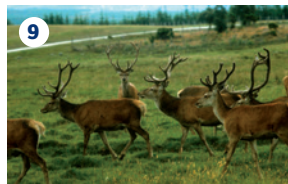
HIGHLAND WILDLIFE PARK, KINGUSSIE – Discover Scottish wildlife past and present and explore themed habitats on foot. The centre's main reserve hosts wolves, wildcat, bison, beaver, lynx, capercaillie and more.