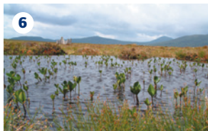
RSPB FORSINARD RESERVE Discover the birds and the plants of the Flow Country. Wildlife displays and guided walks. Visitor centre.