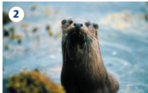
2 KYLERHEA OTTER HAVEN Viewing hide overlooks the Kylerhea Narrows, between Skye and the mainland. Ideal otter habitat with resident wild otters.