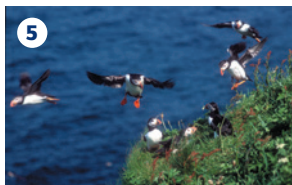
5 HANDA ISLAND – Offshore island with sea cliffs. One of the largest seabird colonies in north west Europe. Ferry (from Tarbet) runs April.