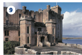
9 DUNVEGAN CASTLE – Seat of the Clan Macleod for seven centuries, with many family artefacts on display.