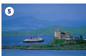
5 DUART CASTLE – 13th-century fortress, the ancestral home of the Clan Maclean, standing on a crag overlooking the Sound of Mull. Spectacular views from the battlements.