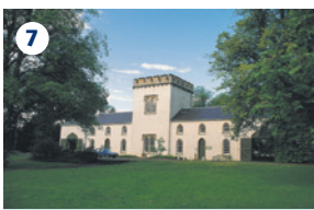
7 CLAN DONALD SKYE VISITOR CENTRE – Mature gardens with extensive walks and nature trails plus museum telling the story of the powerful Clan Donald – the Lords of the Isles.