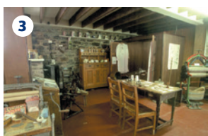
3 MUSEUM OF ISLAY LIFE – Housed in a former church, island heritage presented by way of artefacts and photographs. Edwardian and Victorian times well represented; also the story of whisky distilling.