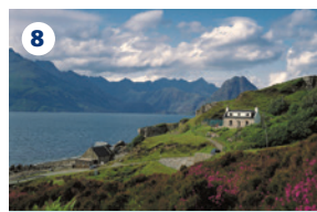
8 ELGOL – Signposted walk (car park on the hill before the harbour) for magnificent view of the Cuillins across Loch Scavaig. Only the first part is suitable for the casual walker.