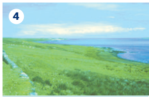
4 LOCH GRUINART, ISLAY – Gentle, level walking here on the north coast of the island, with magnificent deserted beaches and views across to Colonsay.