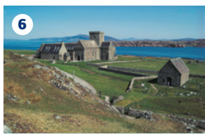
6 IONA ABBEY – Historic site connected with early Christianity in Scotland. Restored abbey buildings originally founded around 1200. Burial place of early Scottish kings.