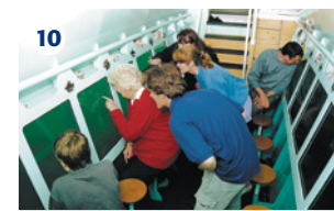
10 SEAPROBE ATLANTIS, KYLE OF LOCHLASH – The UK's only passenger carrying semi-submersible boat allows visitors close-ups of marine life through its underwater observation windows.