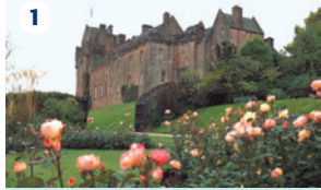
1 BRODICK CASTLE AND COUNTRY PARK Former seat of the Dukes of Hamilton, with furniture, paintings and trophies on display. Famous collection of rhododendrons in the gardens.

From Arran in the Firth of Clyde to the romance of the Isle of Skye, the western seaboard has islands which vary from the traditional holiday playground to the wild and empty. A good network of ferry services makes getting around straightforward and will give you the freedom to hop from island to island.