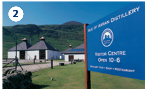
2 ISLE OF ARRAN DISTILLERY Lochranza, one of Scotland's newer distilleries, is in an attractive setting and offers popular tours and tastings plus a visitor centre.