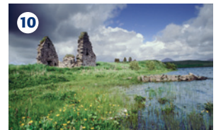
10 FINLAGGAN, ISLAY – Headquarters for generations of Macdonald chiefs, on an island stronghold on a loch. Nearby interpretative centre tells their story.