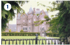
1 BLACK WATCH MUSEUM – The story of the oldest Highland regiment from its original raising as six independent companies in 1725 to the present day.

In times long ago, the Highlands were the strongholds of the Gaelic-speaking clans – a race apart from Lowland Scotland. The clan system, with its emphasis on loyalty and kinship to the clan chief, began to break down during the 18th century, as Scotland changed with the modern age. Eventually, leaving their homelands voluntarily or otherwise, clansfolk were scattered across the world, though many to this day still feel the call of Scotland.