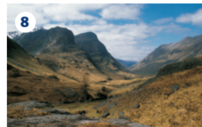
8 GLENCOE – Visitor centre tells the story of the infamous Massacre of Glencoe! A party of Campbell soldiers took shelter with local Macdonalds, then betrayed their hospitality by attempting to murder them all.