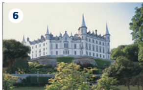
6 DUNROBIN CASTLE – Associated with the Sutherland clearances in the area, there is a Clan Sutherland room within the castle, with genealogical material.