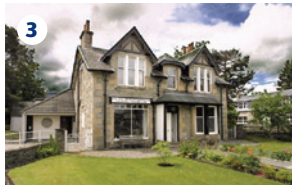
3 CLAN MACPHERSON MUSEUM In Newtonmore, this museum developed by enthusiasts of the Clan MacPherson has a wealth of clan relics, including chanters and swords, as well as genealogical material.