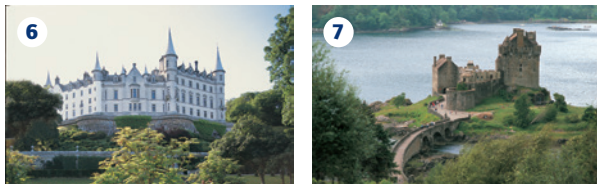
7 EILEAN DONAN CASTLE Much photographed icon of Scotland, destroyed by naval guns during the 1719 Jacobite uprising, and rebuilt in the 1930s.