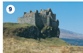
9 DUART CASTLE – Home of the Clan Maclean, set in a prominent position overlooking the Sound of Mull. Originally built in the 14th century, with 20th century restoration.