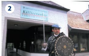
2 KILLIECRANKIE – This National Trust for Scotland visitor centre tells the story of the 1689 battle. Excellent local riverside walks, including the famous 'Soldier's Leap'.