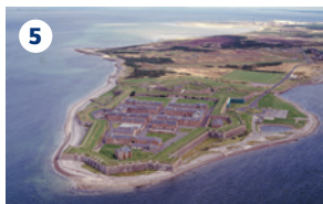
5 FORT GEORGE – Described as the finest surviving complete military fortification in Europe, built to control the Highlands and has never fired a shot in anger.